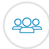
Community Health Navigator Team

PCC staff are responsible for conducting Participant outreach efforts, completing screenings, assisting in making health care and community appointments, including transportation arrangements, perform follow-up tasks related to care/service plan interventions, and assisting in connecting Participants with community resources.