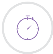
Personal Care Connector Team

A multidisciplinary care team responsible for conducting comprehensive needs assessments, facilitating Person-Centered Planning Team meetings and developing the Person-Centered Service Plan.