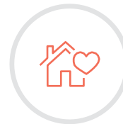
Nursing Home Transition Team

The Community Health Navigator team helps locate difficult-to-engage Participants to reconnect them with care management and provide hands-on coordination.